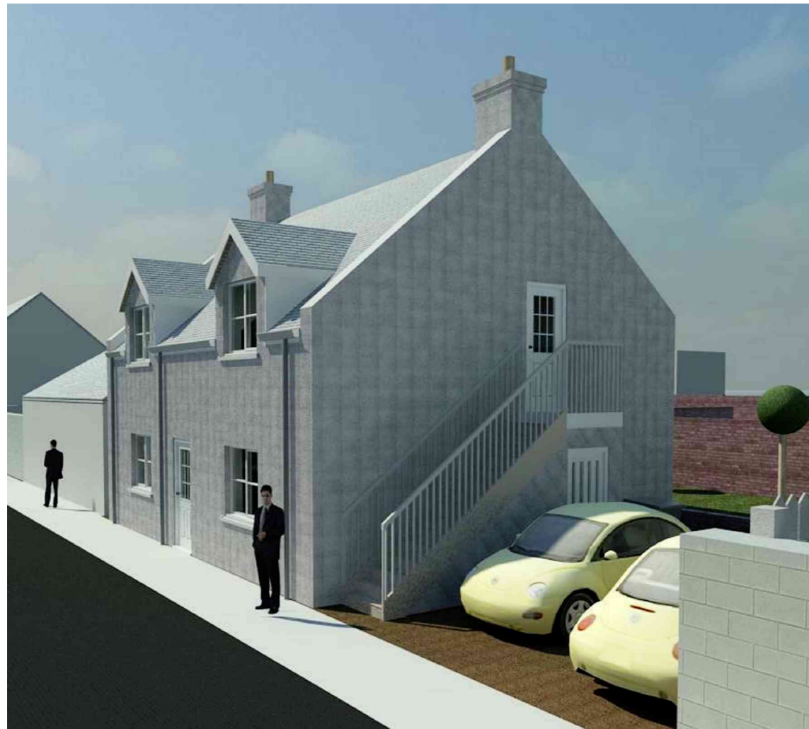
3 3D View 2_1 1:1