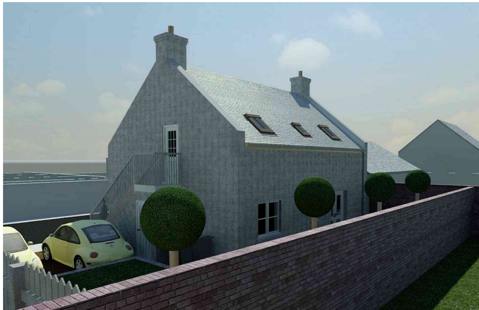
4 3D View 3_1 1:1