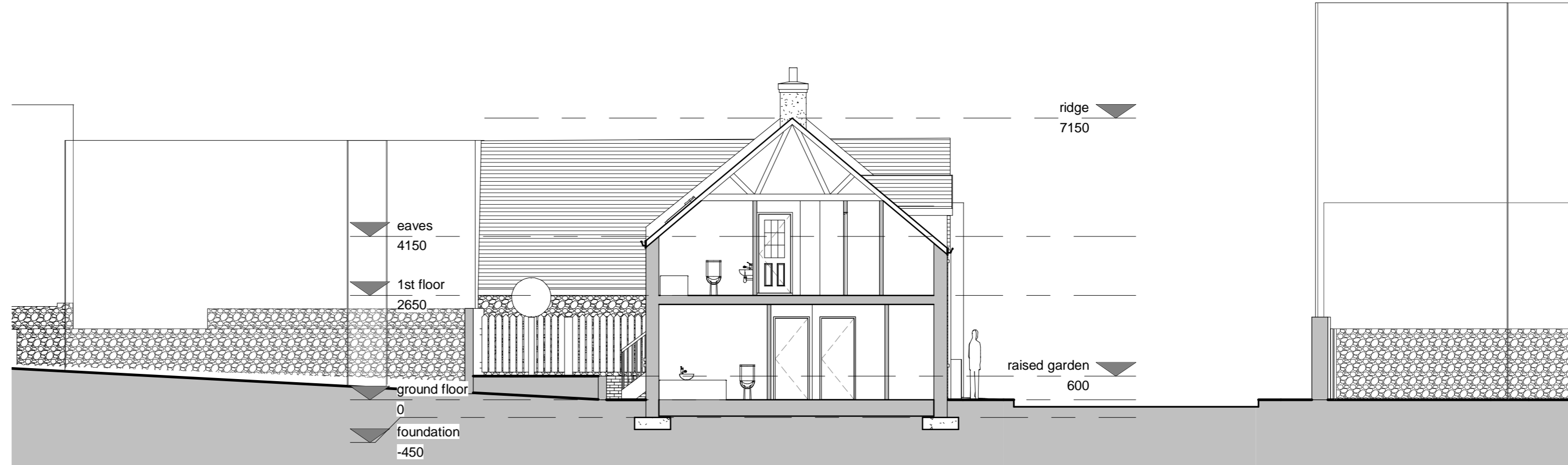
1 Section 1 1:100